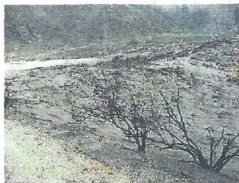
After a fire, vegetation that normally absorbs water is gone. Ash and debris can wash down and clog drainages causing flooding in areas below the fire.

In non-native landscaped areas, property owners may replace vegetation with appropriate fire-resistant, non-invasive plants. A local landscape professional can make recommendations for your particular area.