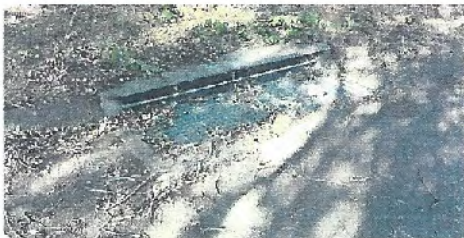
Leaves and debris can clog drains and cause flooding. Clear drain areas around your home before the rain starts. Check curbside gutters and drains and, if they are clogged, alert local officials or other responsible parties.

The most effective way to protect your property against flooding is to prepare before it rains. Preparations can consist of very simple home maintenance but, depending on your circumstances, may involve the construction of permanent drainage systems, walls or other measures to divert water, mud or debris.