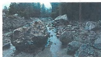
Do not attempt to walk, swim or drive through moving water or flooded areas as debris can be dangerous.