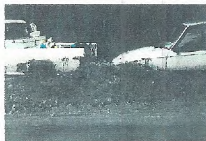
Two feet of water is enough to wash away a passenger vehicle.

If flooding occurs, you are safest staying in your home if it is not being affected by floodwaters, mud or debris. If asked to evacuate, do so immediately and proceed to higher ground or an established shelter. If the water rises suddenly and you cannot evacuate, move to the second floor or, if necessary, the roof.