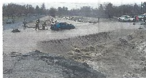
Do not enter a flooded area until it is safe to do so. Flooding can wash out or undermine roads.